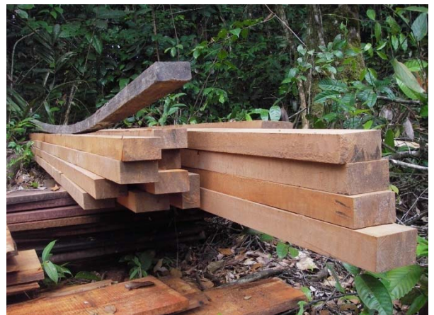
Chain saw wood (on top) versus saw mill wood (on bottom)

As you can see, our portable sawmill has lots of cutting to do in advancing the Lord’s work. As a side note, when we acquire logs for the saw mill, we cut just the tree down that we need. Acres and acres are not cleared and burned for a few trees. Our jungle is healthy and thriving and we are thankful for God’s beautiful environment.