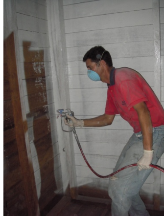
Using the airless painter and the UV water filter