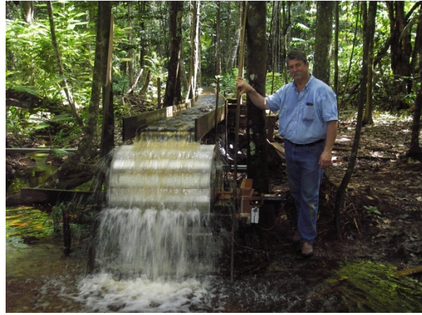
Water wheel making hydro-energy

also improved by the installation of a UV water purifier and filter. Our drinking water is now much safer and better. What a blessing! Nine of our campus showers were plumbed and tiled and our solar system was fine tuned to maximize the amount of energy we can obtain and store in our batteries. In addition, a new and improved water wheel was installed which will provide continuous energy for our campus. Many of our buildings were also outfitted with railings which improved the ascetics and safety of each structure. All of our floors will be looking much better “just now” as the group also brought a floor sander which will help our rough and uneven wooden floors become beautiful.